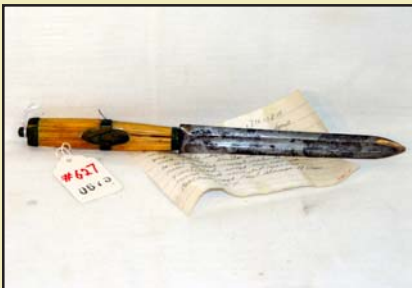
Naval officer's dirk owned by Capt. Sherman: $2,157