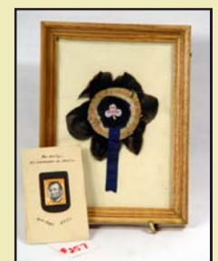
Abraham Lincoln mourning badge: $539