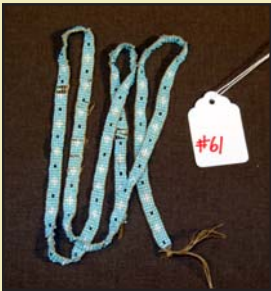
18thC Mohawk wampum belt: $738