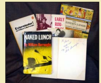
William Burroughs books, including a signed "Naked Lunch," $341