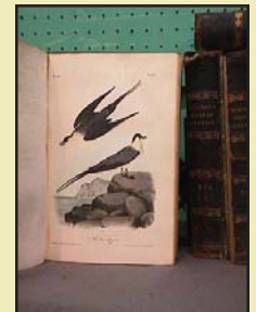
Audubon's 1840 Birds of America set: $39,500