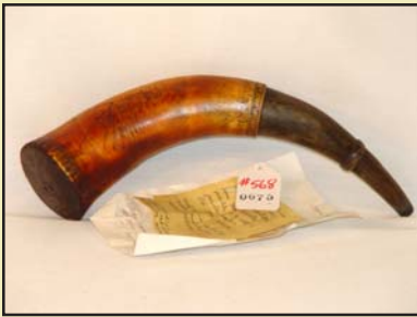
Carved Revolutionary War powder horn: $4,824