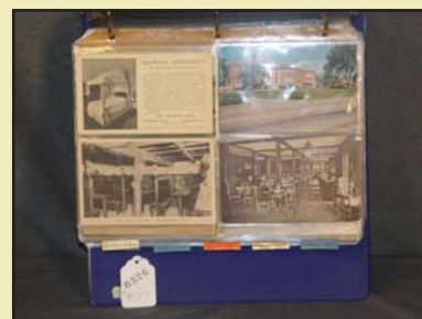
Vintage postcards of Raymond Avenue, Poughkeepsie, N.Y.: $900