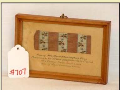
Fragment from a dress owned by Martha Washington: $1,022