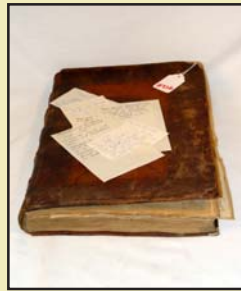
18thC ledger: $1,816