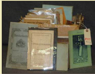
1896 battle pamphlets and related materials: $1,929