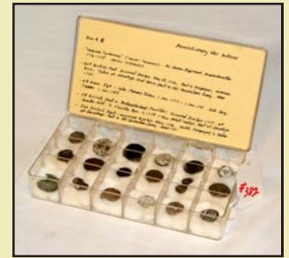
Revolutionary War buttons: $2,951