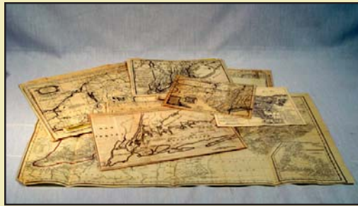
Unframed early U.S. maps: $1,476