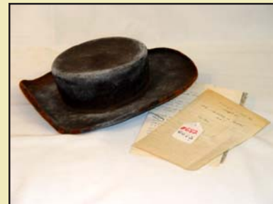
Ulster County Revolutionary War military hat: $1,022