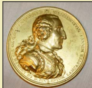
1805 Eccleston Medal of George Washington: $1,816