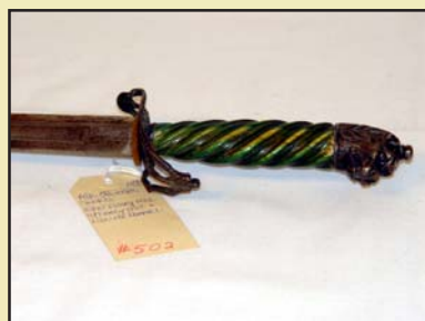
Revolutionary War officer's sword with lion's head hilt and ivory handle: $14,577