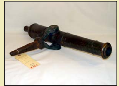
Revolutionary War bronze swivel cannon from Fishkill Landing: $7,945