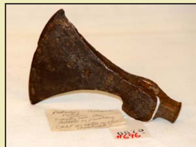
Mohawk iron ax head from Oriskany area: $1,589