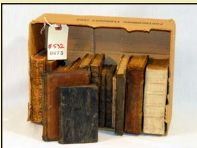
Antique books, including 1772 and 1840 publication dates: $5,675