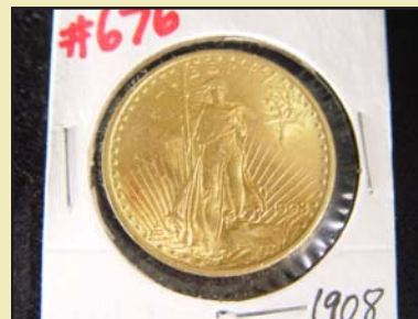
1908 $20 gold piece: $455