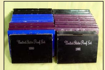
Lot of 1968-1993 proof sets: $550