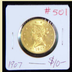
1907 $10 gold coin: $272