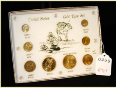
1899 U.S. gold type set: $3,065