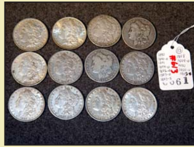
Lot of 12 Morgan silver dollars: $130