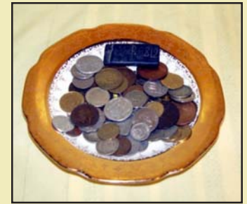
Tray lot of miscellaneous foreign coins: $120