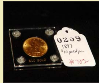
1897 $10 gold coin: $284