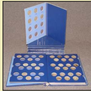
Eight coin books with 120 Washington quarters: $132