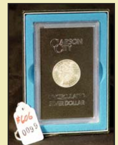
Carson City silver dollar: $248