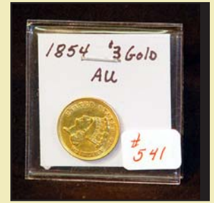
1854 $3 gold coin: $908