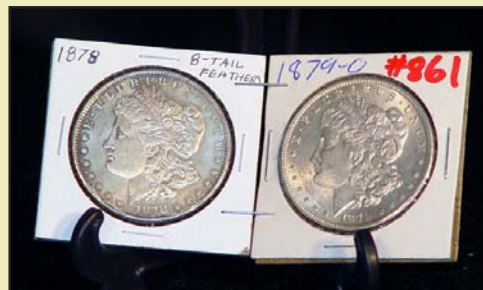
1878 & 1879-O 8-tail feathers: $176