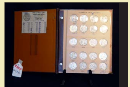
Book of Franklin half dollars: $159