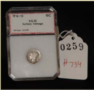
1916-D mercury dime graded VG10: $709