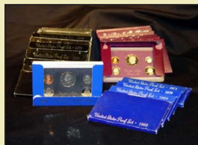
Lot of 23 uncirculated proof sets, starting with 1973: $187