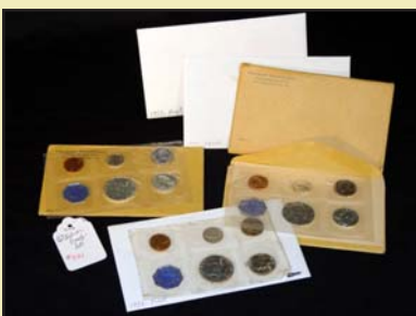
1956-1958 and 1962-1964 silver proof sets: $191