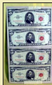
1963 red seal $5 U.S. notes: $246