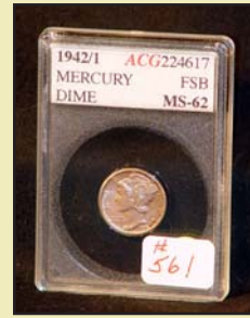
1942 mercury dime: $1,476