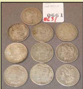
Lot of 10 silver dollars, including 1890 Morgans: $140