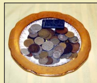
Tray lot of miscellaneous foreign coins: $120