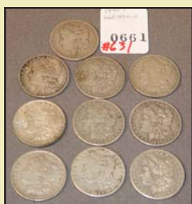
Lot of 10 silver dollars, including 1890 Morgans: $140