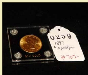
1897 $10 gold coin: $284