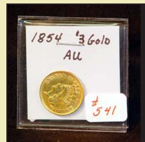
1854 $3 gold coin: $908