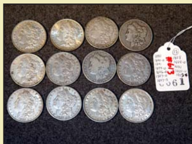
Lot of 12 Morgan silver dollars: $130