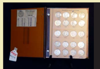
Book of Franklin half dollars: $159