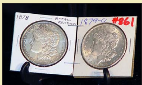
1878 & 1879-O 8-tail feathers: $176