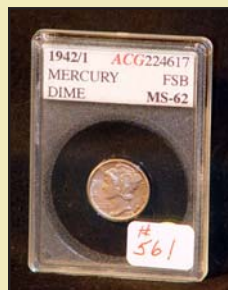
1942 mercury dime: $1,476