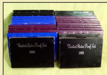
Lot of 1968-1993 proof sets: $550