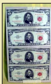
1963 red seal $5 U.S. notes: $246