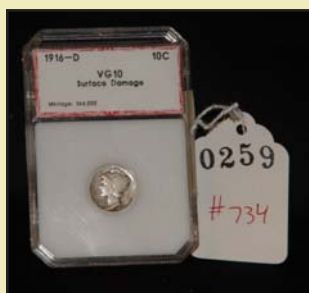
1916-D mercury dime graded VG10: $709