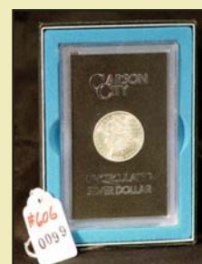
Carson City silver dollar: $248