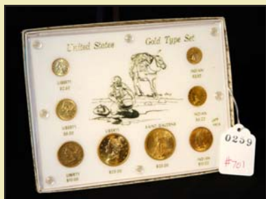
1899 U.S. gold type set: $3,065