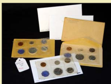
1956-1958 and 1962-1964 silver proof sets: $191