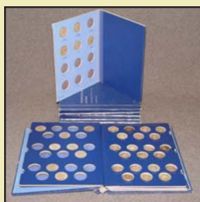
Eight coin books with 120 Washington quarters: $132