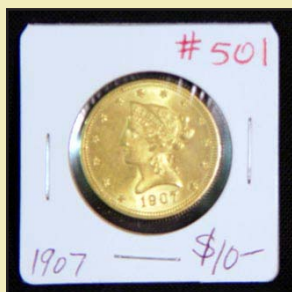
1907 $10 gold coin: $272